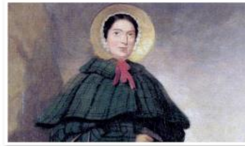
Portrait of Mary Anning

Mary Anning was a British palaeontologist, who was born in 1799. She made many important fossil discoveries.